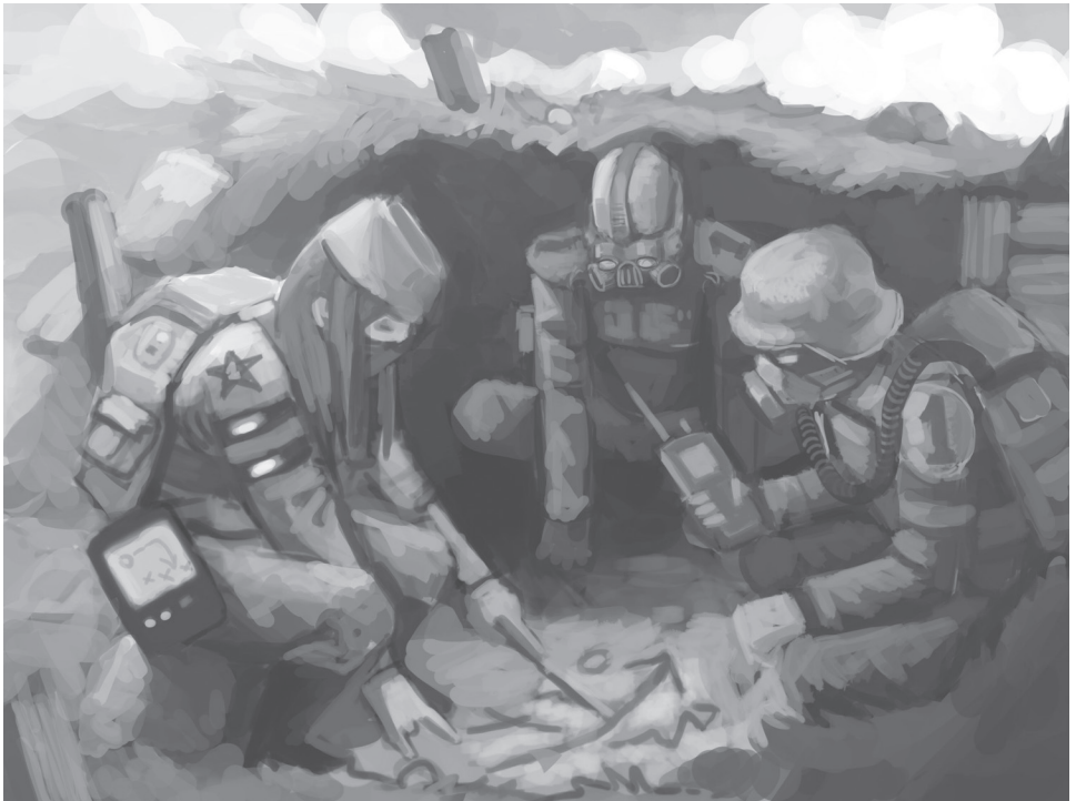
Artist: Christopher Reach

I did not set out to define the phases of prep; I came across them naturally as I began to take an interest in productivity and life hacking (the latter being the practice of using tricks, shortcuts, and various other methods to increase efficiency in different